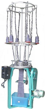
QJY-CW-320A | 1 Color

The QJY-CW-320A magic long wool scarf knitting machine uses acrylic fibers, terylene, bulk yarn rabbit yarn etc as the material to knit seamless scarf with any stripes. The machine can stop automatically when the yarn breaks. The knitted scarf has attractive styles, soft and bright color. It can change into assorted clothes accessories by different wearing styles, such as hat, tippet, jacket, skirts and evening dress. So we also call it "magic scarf". It is not only warm and attractive, but also changeable. Key spare parts like cylinder and inner sinker stand are made from good steel. It is real and durable.